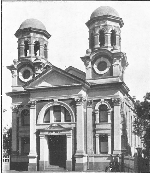
St. Kilda Synagogue, 1921